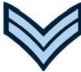
Corporal / Caporal