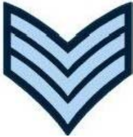
Sergeant / Sergent