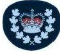
Warrant Officer Second Class Adjudant Deuxième Classe